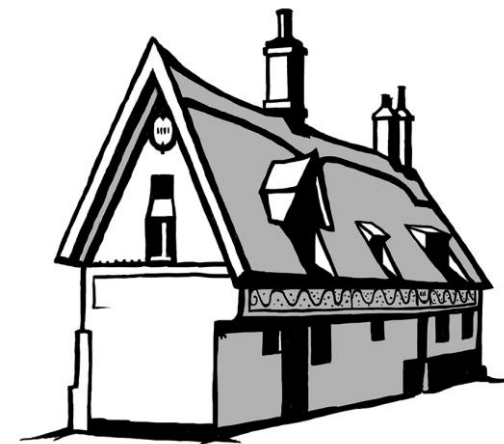
Bishop Bonner's Cottage Museum