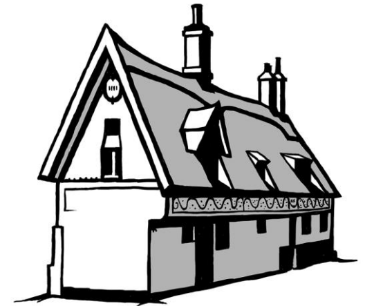
Bishop Bonner's Cottage Museum